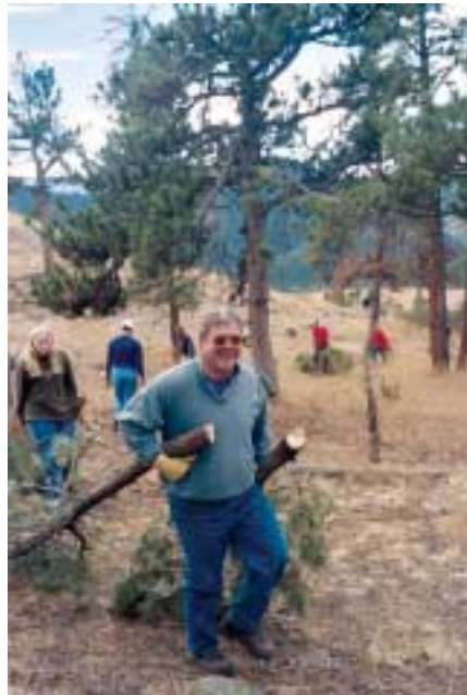
Members of LifeBridge Christian Church volunteer as part of the continuing Boulder County (Colorado) Open Space project.

EXTERNALLY FOCUSED CHURCHES ARE DETERMINED TO MAKE A DIFFERENCE IN SOCIETY.