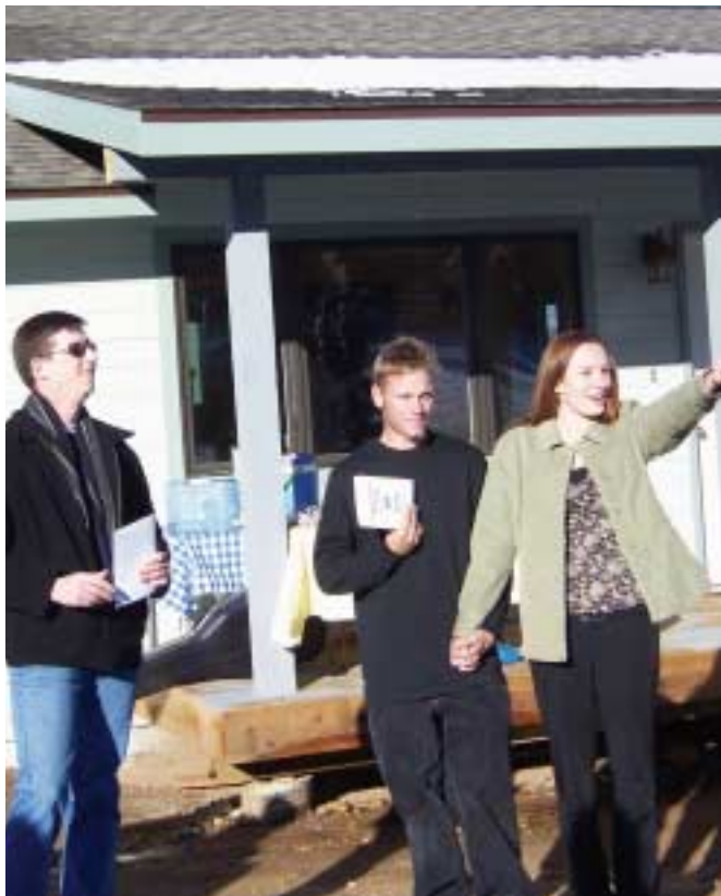
The Christian Church of Estes Park has helped with many community projects, including helping build Habitat for Humanity homes. This couple is receiving their new home.

I reminded them that just down the street from the municipal build-