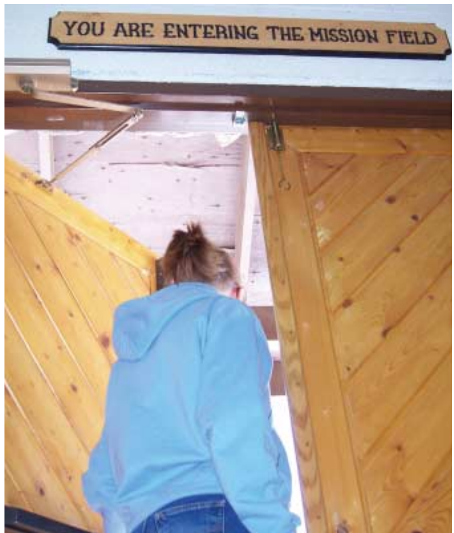
The sign above the door at the Christian Church of Estes Park serves to remind members that a church must look outward to fulfill the Great Commission.